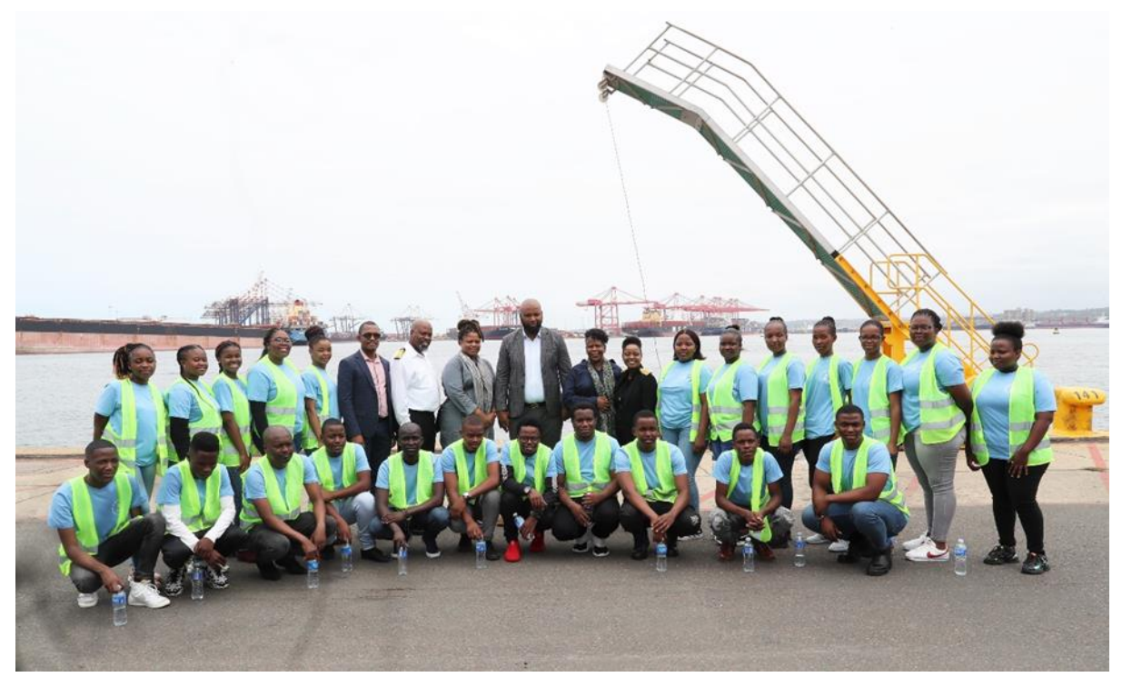
KZN Public Wealth Fund

The concept of developing the Maritime University in the province of KwaZulu-Natal is supported by a review of a number of national and international models, such as Antwerp, Rotterdam and Singapore for achieving a reputation for excellence in maritime education, training and research. In such cases, a major port city becomes home to a number of respected education, training and research institutions which, for the most part, are complementary to one another; and which receive support from the education, government and private sectors; and which make steady progress over time in the number and quality of their offerings.